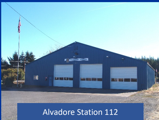
Alvadore Station 112