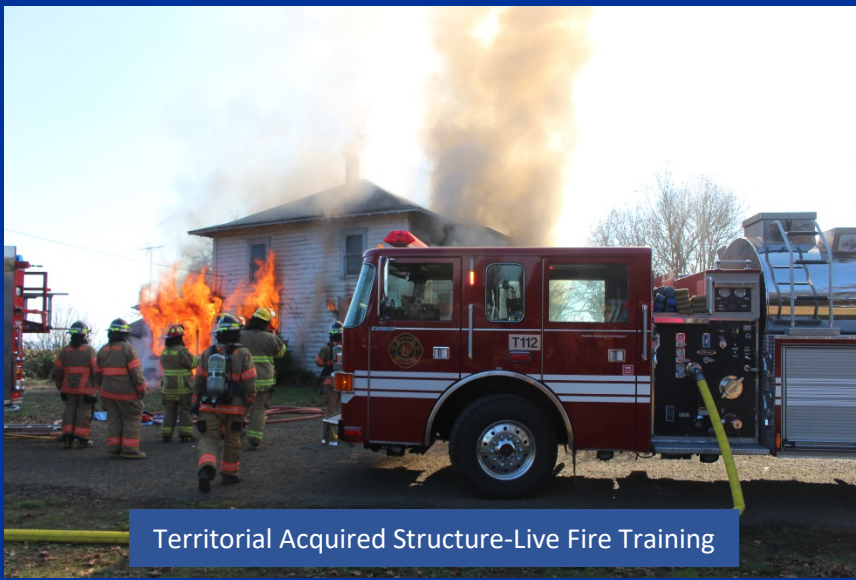
Territorial Acquired Structure-Live Fire Training